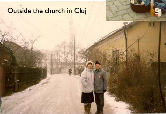
Outside the church in Cluj